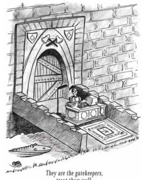
treat them well.

A Committee Legislative Assistant, in addition to the above responsibilities, sets up Committee meetings, reserves rooms, gets legislators' folders and name tags in order, keeps minutes, and prepares Committee reports.