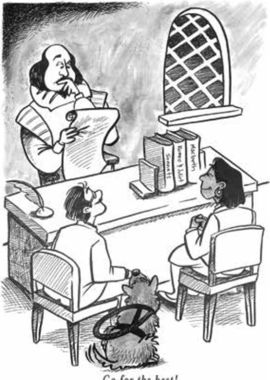
Go for the best!